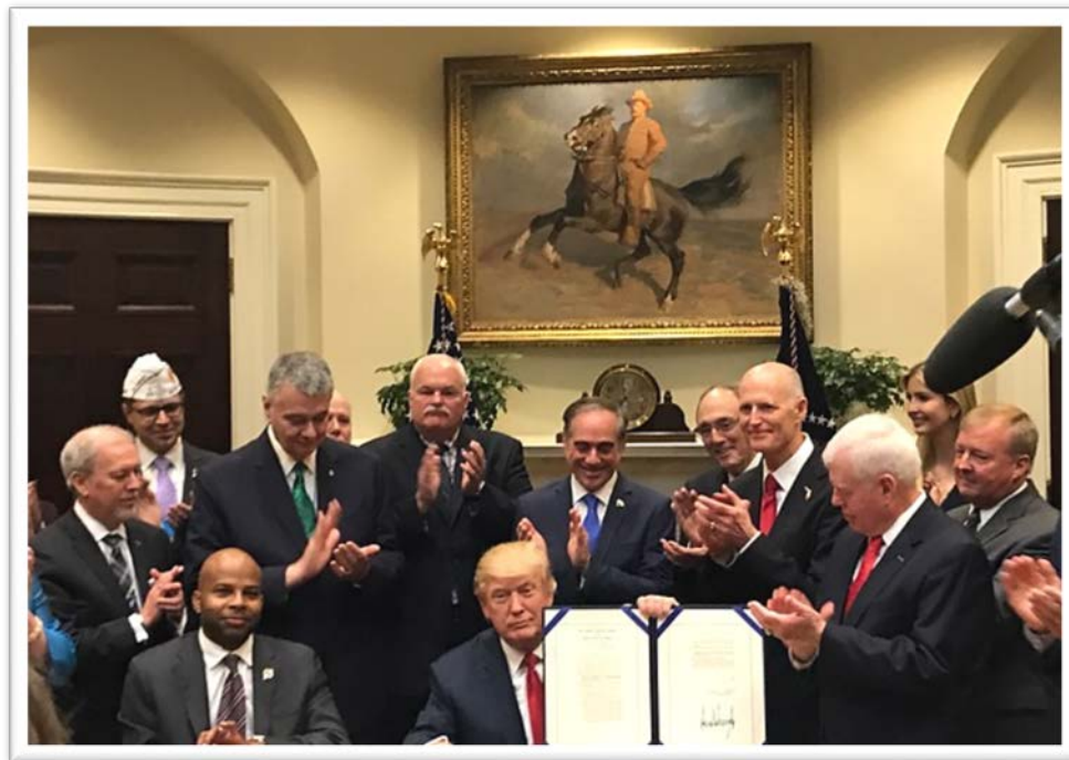
Veterans Bill Signing Ceremony, White House