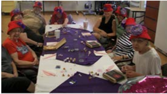
The Veterans Task Force celebrated Mother's Day with a Mother's Day luncheon for the Sims Home ladies. Each veteran enjoyed person pan pizzas, flowers, candy and homemade pies (left). The ladies don their Red Hats for the occasion.

There are a number of registered volunteers in the State Veterans' Homes that provide invaluable services for our veteran residents. The multitude of hours that are contributed add to the quality of life for the residents as well as allow the skilled employees to attend to more complicated, professional level tasks associated with resident care.