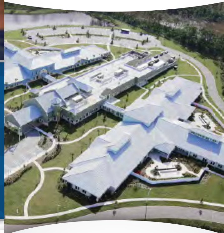
Ardie R. Copas State Veterans' Nursing Home Port St. Lucie, Florida

We take great joy in the relationship between our close-knit staff and the residents they lovingly serve at each of our veterans' homes – everyone valuing healthy life practices and supporting one another. We make sure every Veteran who comes into our facility is well taken care of and feels like they are a part of our family.